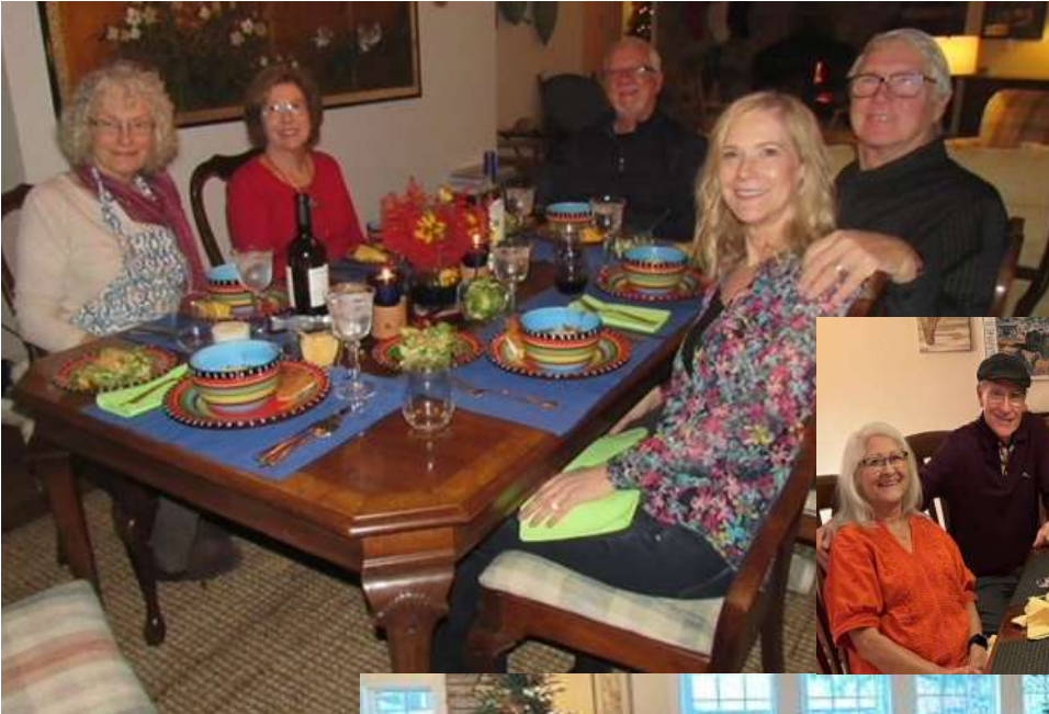
Gnaw & Jawsers First Dinners