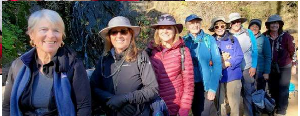
Hikers December 2023