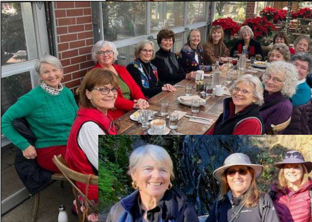
Garden Group Holiday Luncheon High-Hand Nursery Café, Loomis