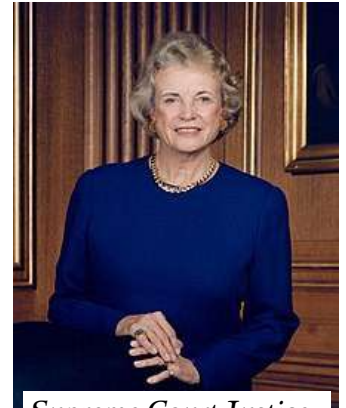
Supreme Court Justice O'Connor, 1981-2006

To learn more about Sandra Day O'Connor, I recommend reading "Dinners With Ruth". Our Mostly Fiction Book Club enjoyed reading and discussing this book in December. This is a non-fiction book by Supreme Court NPR reporter Nina Totenberg. You will learn a lot about Nina, the workings of the Supreme Court, including the importance of Sandra Day O'Connor and her sisterhood with Ruth Bader Ginsberg on the bench. I also recommend a PBS special "Sandra Day O'Connor – The First," which was shown on KVIE on December 11 th .