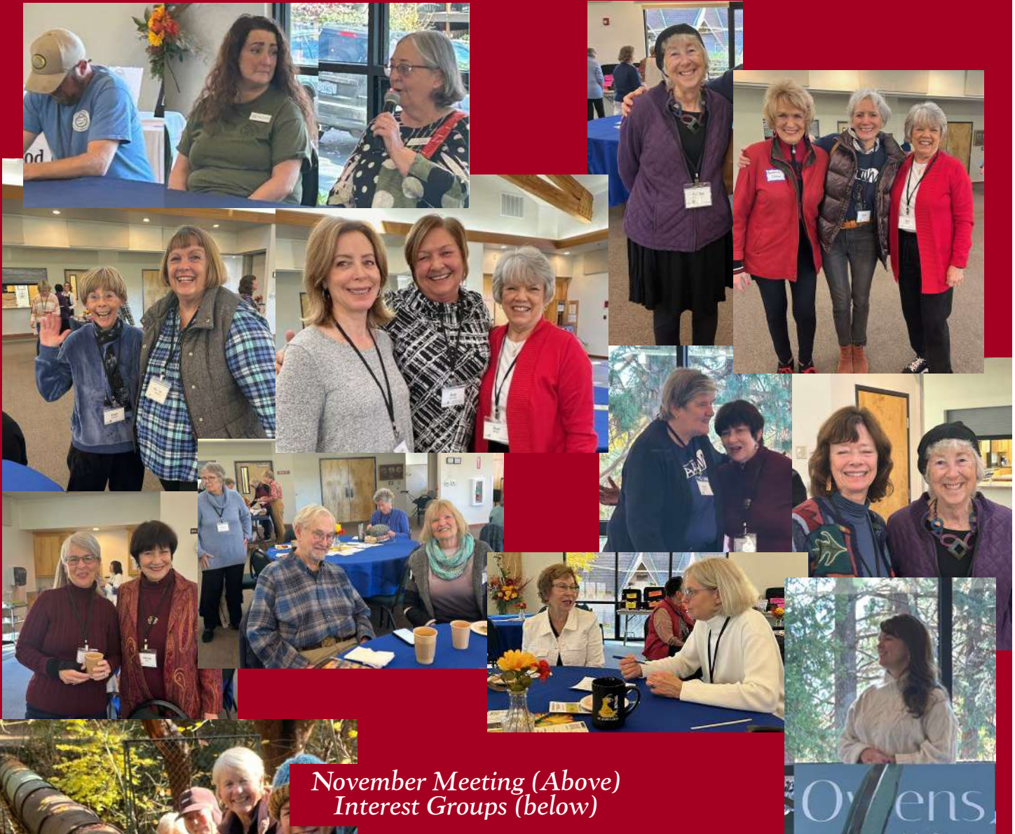
November Meeting (Above) Interest Groups (below)