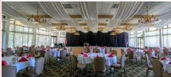
North Ridge Country Club, 7600 Madison Ave. Fair Oaks