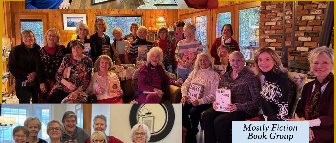
Mostly Fiction Book Group