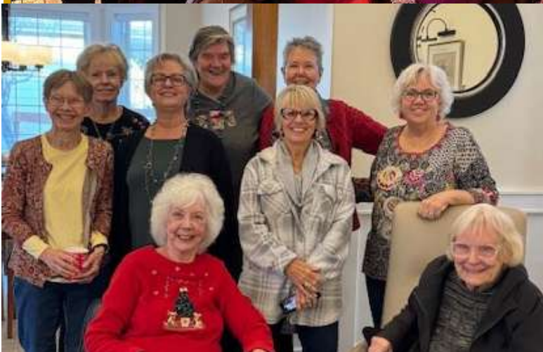
Non-Fiction Book Group