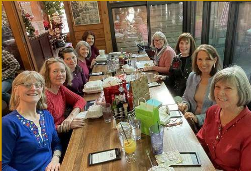
Evening Book Group

Suggested day and time: Mondays from 5:30 p.m. to 7:30 p.m. This is subject to change depending on availability of interested members.