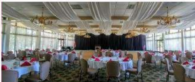
North Ridge Country Club, 7600 Madison Ave. Fair Oaks

I find the breadth and scope of the projects fascinating. These are just a few of the many, many projects. It's not too late to send your support of these efforts to the AAUW fund. You can specify the area to which you would like your donation to go. And many thanks to all of you who contribute to AAUW FUNDS! Your money can go around the world.