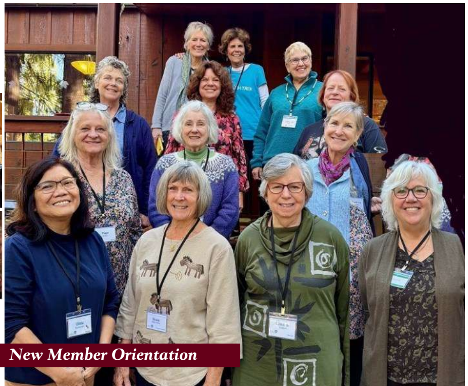
New Member Orientation