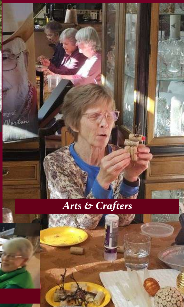
Arts & Crafters