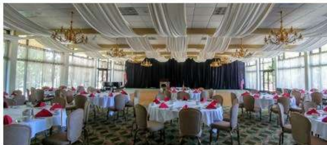
North Ridge Country Club, 7600 Madison Ave. Fair Oaks

I look forward to another great year ahead.