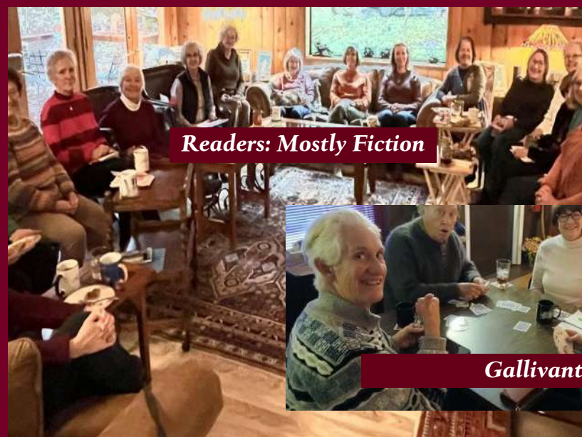
Readers: Mostly Fiction