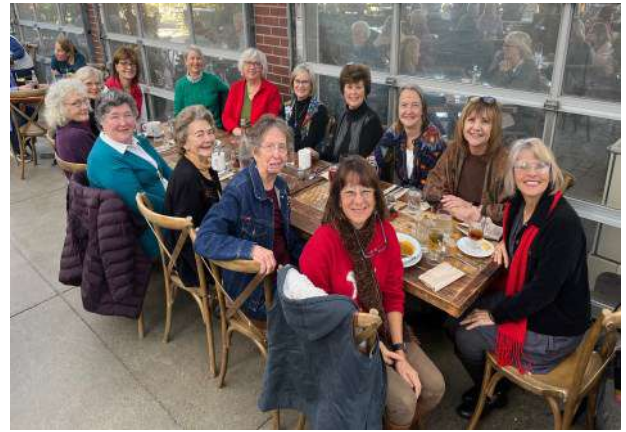
Holiday lunch for the Garden Group at High-Hand Cafe/ Nursery, Loomis, December 2024