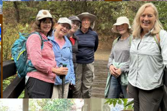
Gallivanterers (above) Hikers (left) Gardeners (below) Mostly Fiction (below left)