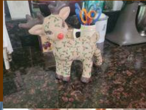
◀ Arts & Crafts: November projects, holiday reindeer